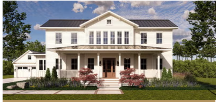
Old Oyster Retreat