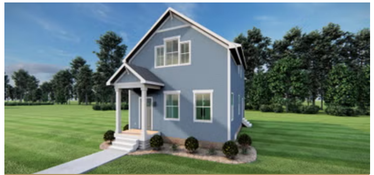
Lockwood Starting at $441,990