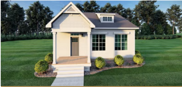
Monson Street Cottage Starting at $394,900