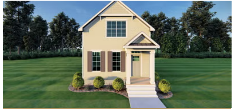
Pritchard Starting at $422,900