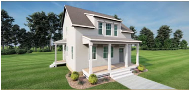
Leland Starting at $435,990