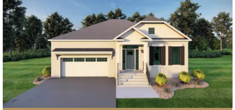
Linden Terrace Starting at $922,990