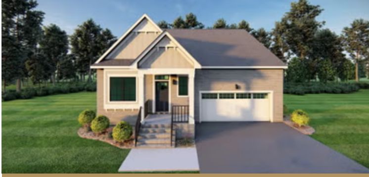
Belmont Terrace Starting at $893,990