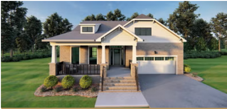
Hartford Terrace Starting at $945,990