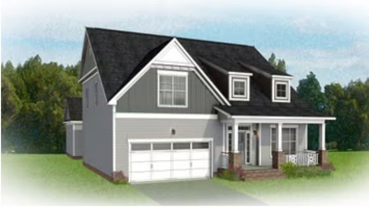
Arts & Crafts