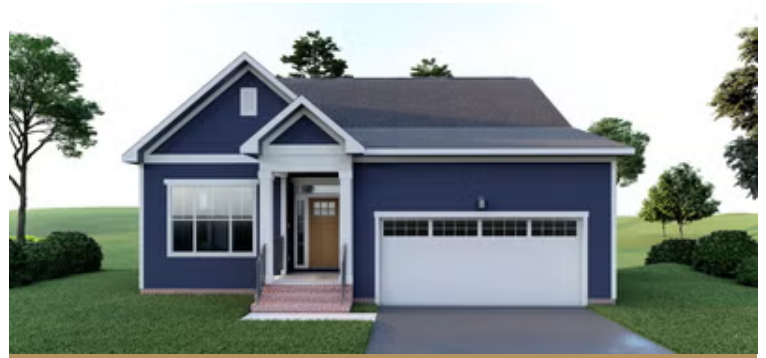
Pearl Terrace Starting at $534,900 🏠 2,170 🛏️ 3 🚗 2.5