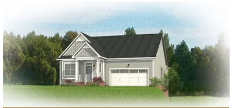
Belmont Terrace Starting at $555,000 🏠 1,806 🛏️ 2 - 4 🚗 2.5 - 3