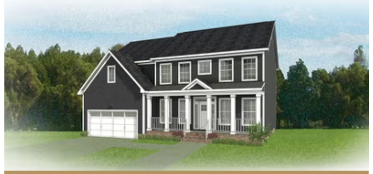
Bradford Starting at $526,900 🏠 2,706 🛏️ 4 🚗 2.5