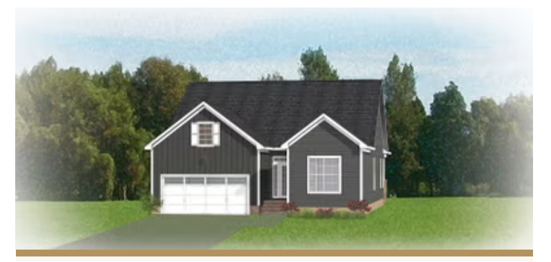
Magnolia II ▲ 1,532 🛱 3 🚔 2