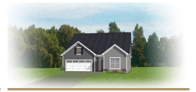
Magnolia ▲ 1,688 🛱 3 🚔 2