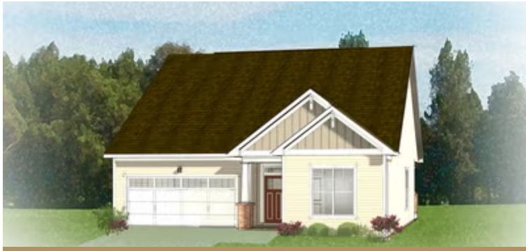
Azalea Ranch ↓ 1,561 ■ 2 ↓ 2