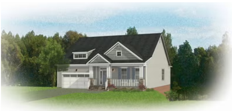
Linden Terrace Starting at $659,990 🏠 2,918 🛏️ 3 🚗 2.5