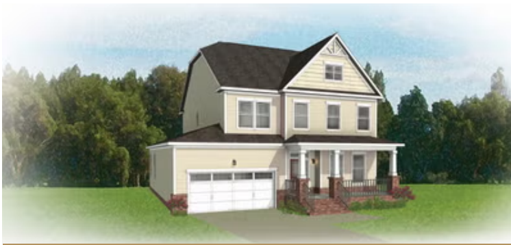
Savannah Starting at $613,990 🏠 2,842 🛏️ 4 - 5 🚗 2.5 - 3