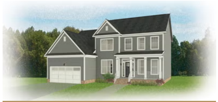
Westminster Starting at $595,990 🏠 2,641 🛏️ 3 - 5 🚗 2.5 - 3