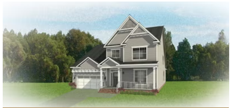
Linden III Starting at $627,990 🏠 2,677 🛏️ 3 🚗 2.5