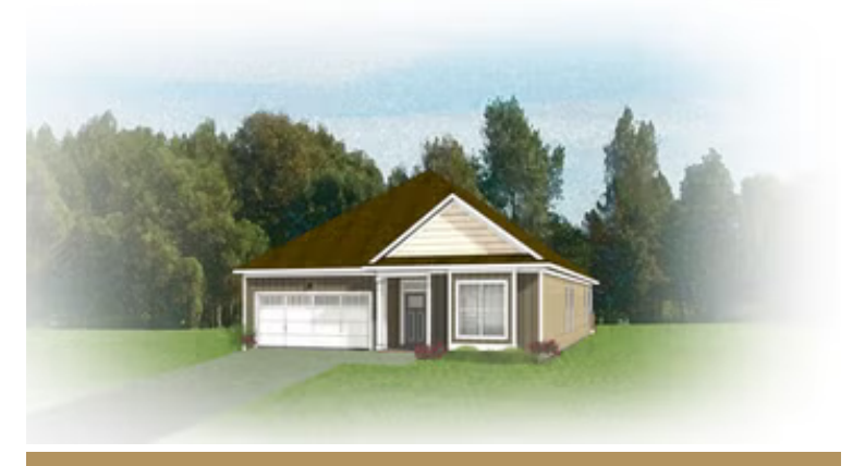
Arts & Crafts