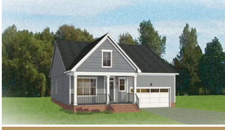
Arts & Crafts